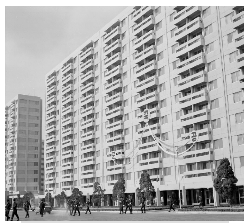
Figure 4. The entrance plaza of the Yeouido Sibum Apartments