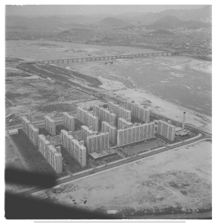
Figure 1. Yeouido Sibum Apartments in 1973

In 1971, on a previously barren construction site on the eastern part of Yeouido, one of the few inhabitable islands in the Han river, the towering profile of the Yeouido Sibum Apartments, the first high-rise apartment complex in Seoul, gradually appeared against the backdrop of Mount Namsan. Planned as the biggest and most technologically advanced apartment complex ever built in Seoul, the Yeouido Sibum Apartments was intended as an ideal family housing complex, with 1,584 apartments of four different types for the upper middle-class residents of the city, served by South Korea's first apartment elevators moving between 12 floors.